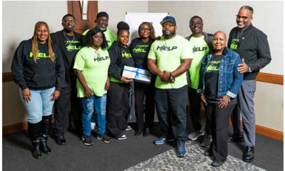
2025 SCF Board of Directors' Community Improvement Initiative $40,000 grant recipient, HELP CVI.